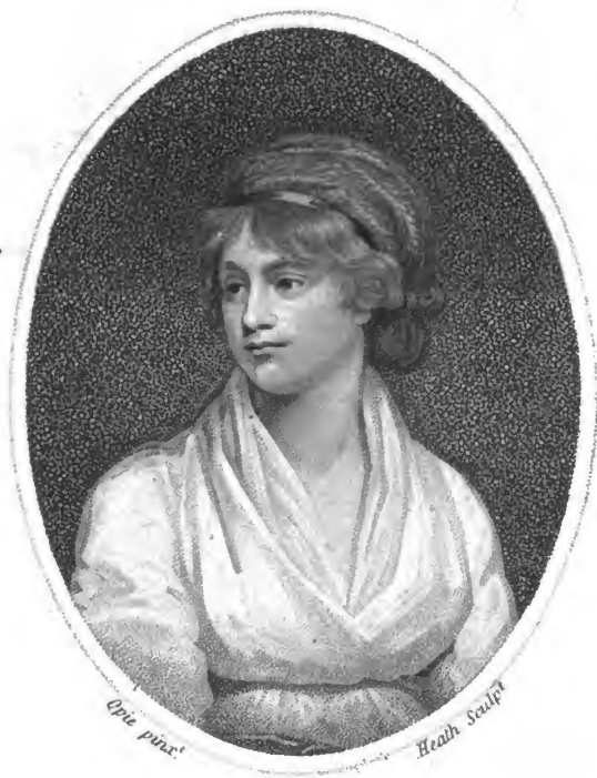
Mary Wollstonecraft Godwin.